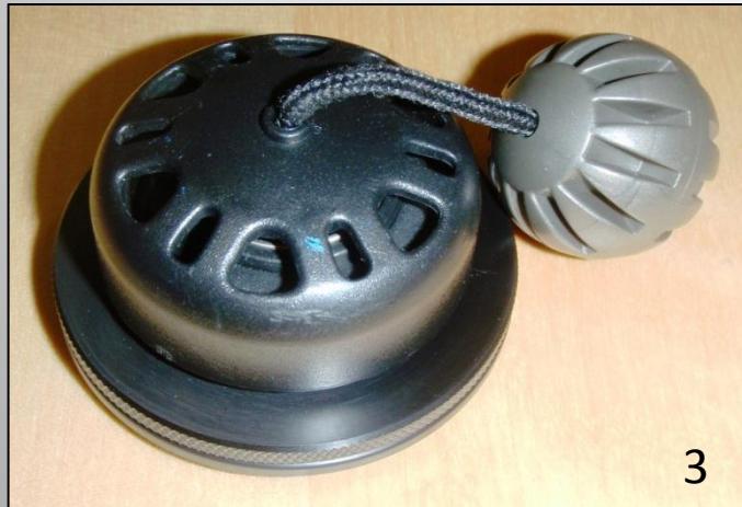
Pull Dump To Ensure Workability.