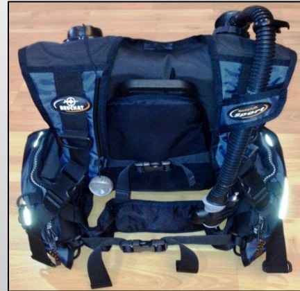
Beuchat Diameter Ø 47mm

With help from our distributors and customers, we have identified a few brands who have changed their designs and have different threads sizes over the years. Although not frequent, it has happen. It will be wise to ask from your overseas customers the : i) Brand, ii) Model and iii) Diameter size before you accept payments and ship.