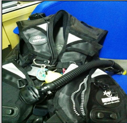
Beuchat Diameter Ø 51mm