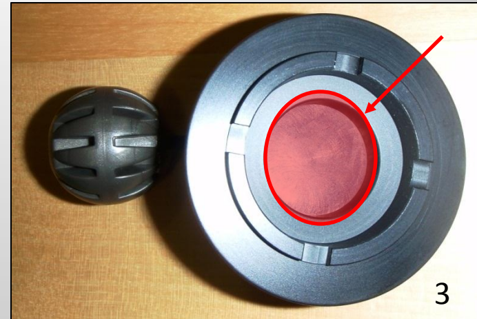
Rubber Seal Must Fully Cover The Center Internal Diameter. (ID)